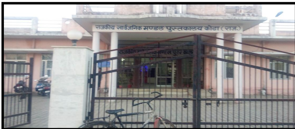
Figure 3.1: Front view of Govt. Divisional Public Library Kota.

Kota is the third greatest city in Rajasthan, situated at a separation of 500 Kilometers (approx.) from National Capital of India, New Delhi and 242 Kilometers (approx.) from State Capital Jaipur on National Highway 12. Kota divisional Public library was set up in the year 1956.