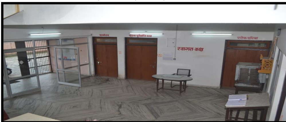
Figure 3.2: Corridor of Govt. Divisional Public Library Kota.

Kota is the third greatest city in Rajasthan, situated at a separation of 500 Kilometers (approx.) from National Capital of India, New Delhi and 242 Kilometers (approx.) from State Capital Jaipur on National Highway 12. Kota divisional Public library was set up in the year 1956.