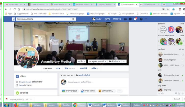
Figure 2 Assm Library Facebook Account