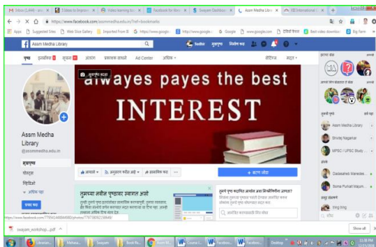
Figure 1 Assm Library Facebook Page